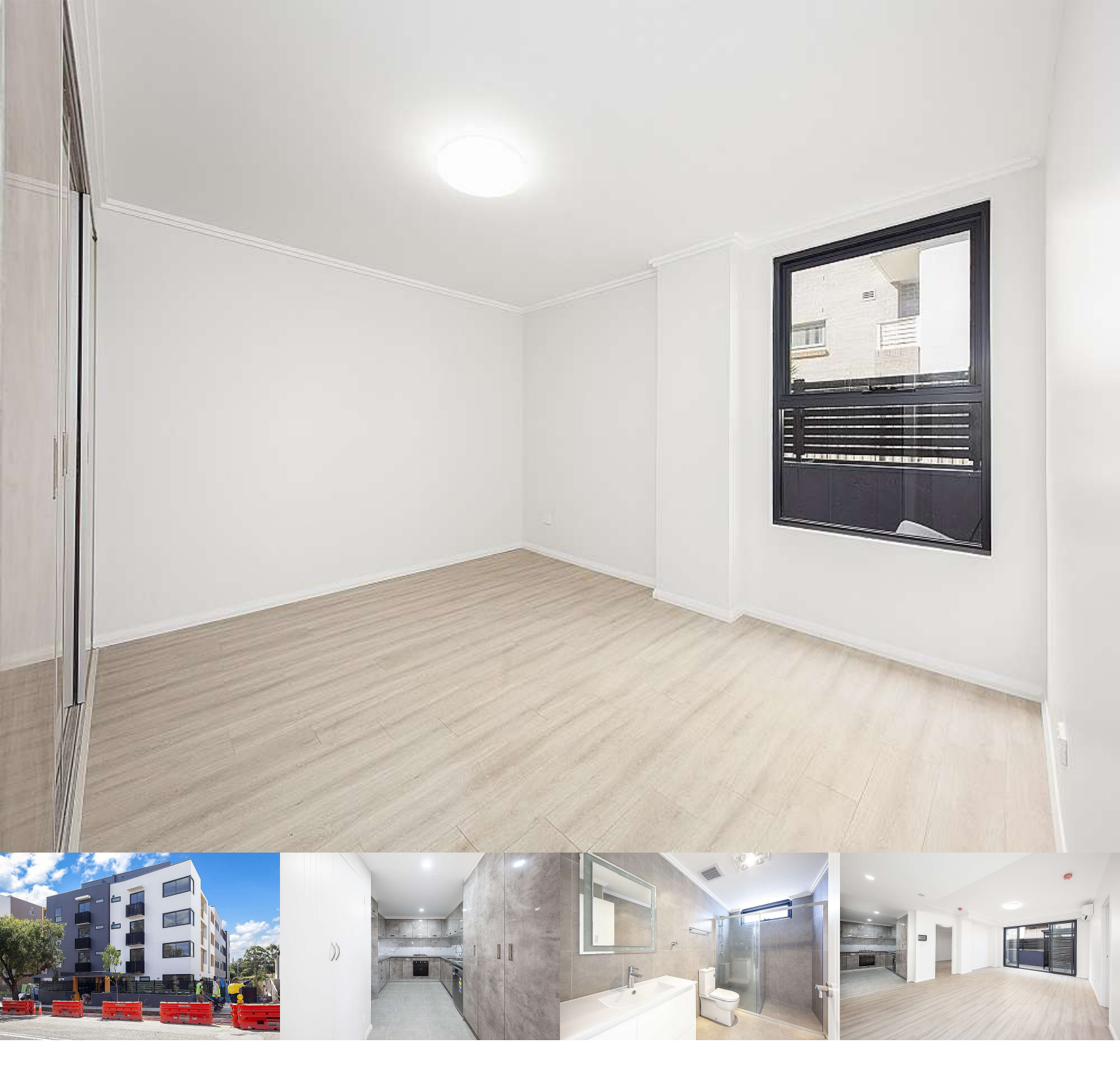
49-51 Veron Street, Wentworthville